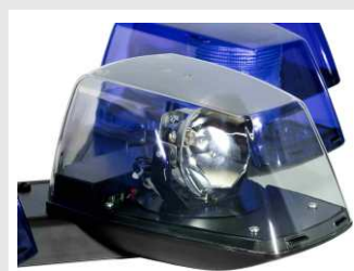
VisiVector pod, search light