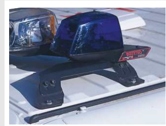
Permanent roof mount