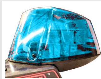
Sputnik LED priority light pod

SCS1000-PA, public address kit for SCS1000 compact sirens, non-watertight remote control with volume and microphone functions.