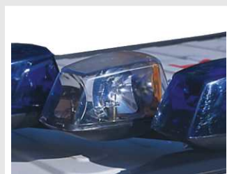
Auxiliary pod with three directional lights