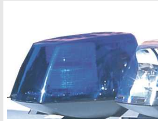
Strobe priority light pod