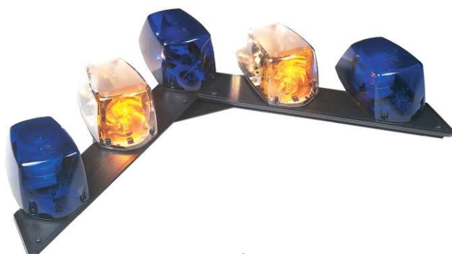
5-pods Vector Series Lightbar