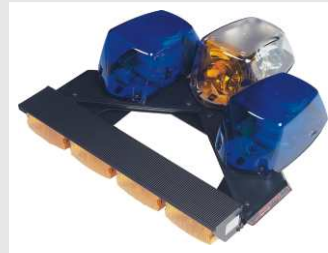
3-pod Vector with 4-module Signalmaster

Consult our Commercial Department for configuration.