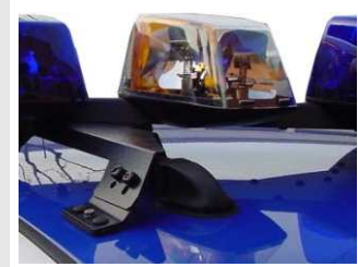
19 or 23 ways roof connector