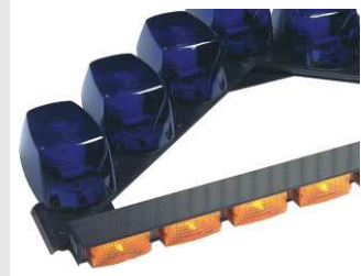
7-pod Vector with 8-module Signalmaster