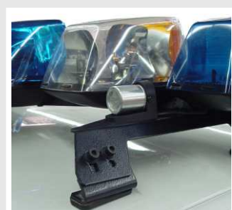
VL-CLD, Stop Light Set