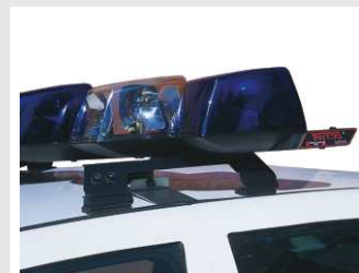
Detachable hook-on mount