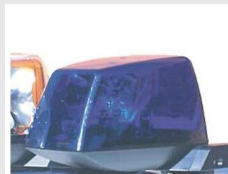
Rotating halogen priority light pod