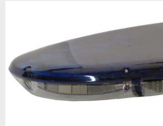
Sputnik LED priority lights