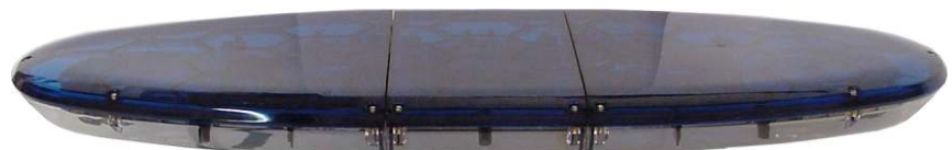
ARJENT Sputnik Series, LED lightbar