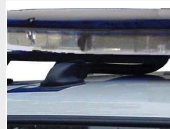
23 Ways roof connector