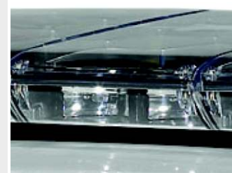
Front halogen light