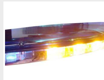
6-modules Sputnik LED Signalmaster